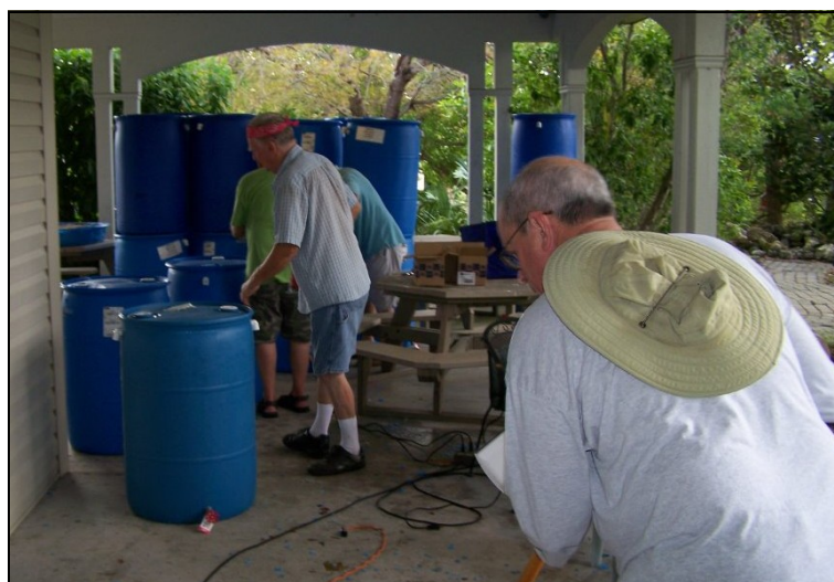
The rain barrel workshop was a huge success! Not a barrel was left!