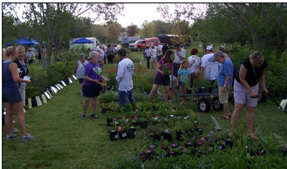
The plant selection was so amazing that customers had a hard time choosing!