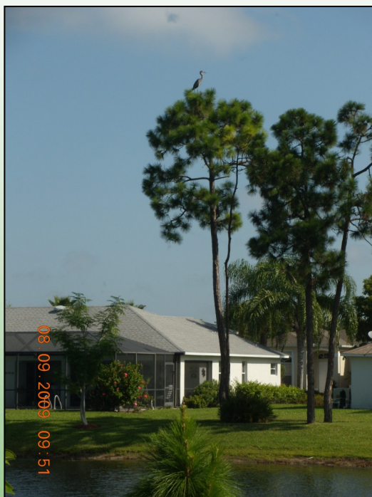
A great Blue Heron enjoying what once was....