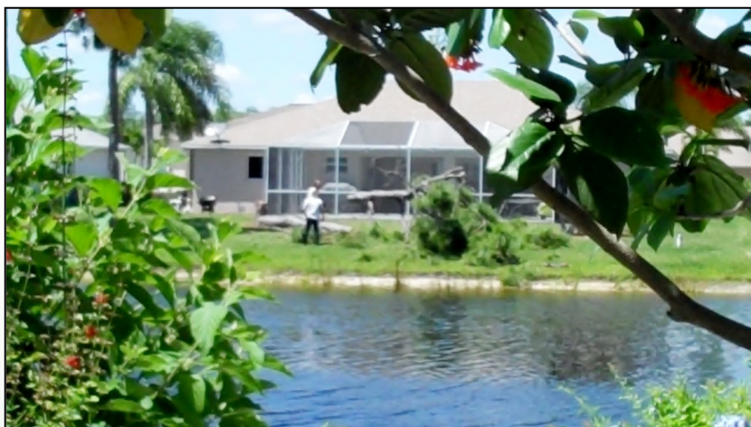
A bad day for the tree...and me.

I was horrified! I could hardly breathe.